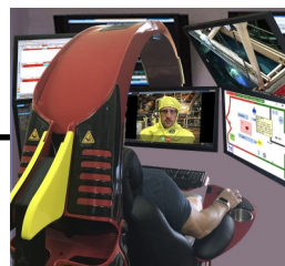
Remote Monitoring Station running Security Center's Sipelia Module