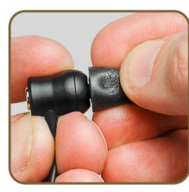
Step 2 Carefully compress the foam eartip on the stem/sound port.