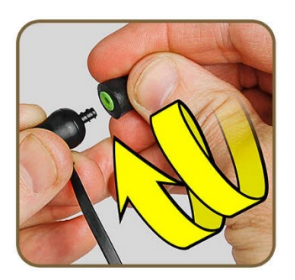
Step 1 Twist clockwise to place on a new foam eartip and counter clockwise to remove.