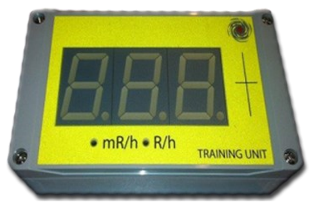
WAM-D Training Unit