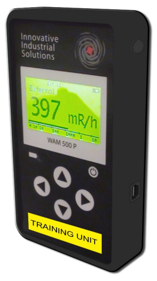
WAM-P Training Unit