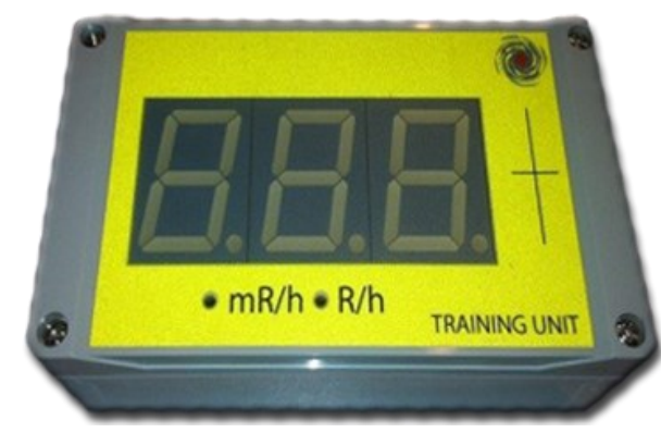
WAM-D Training Unit