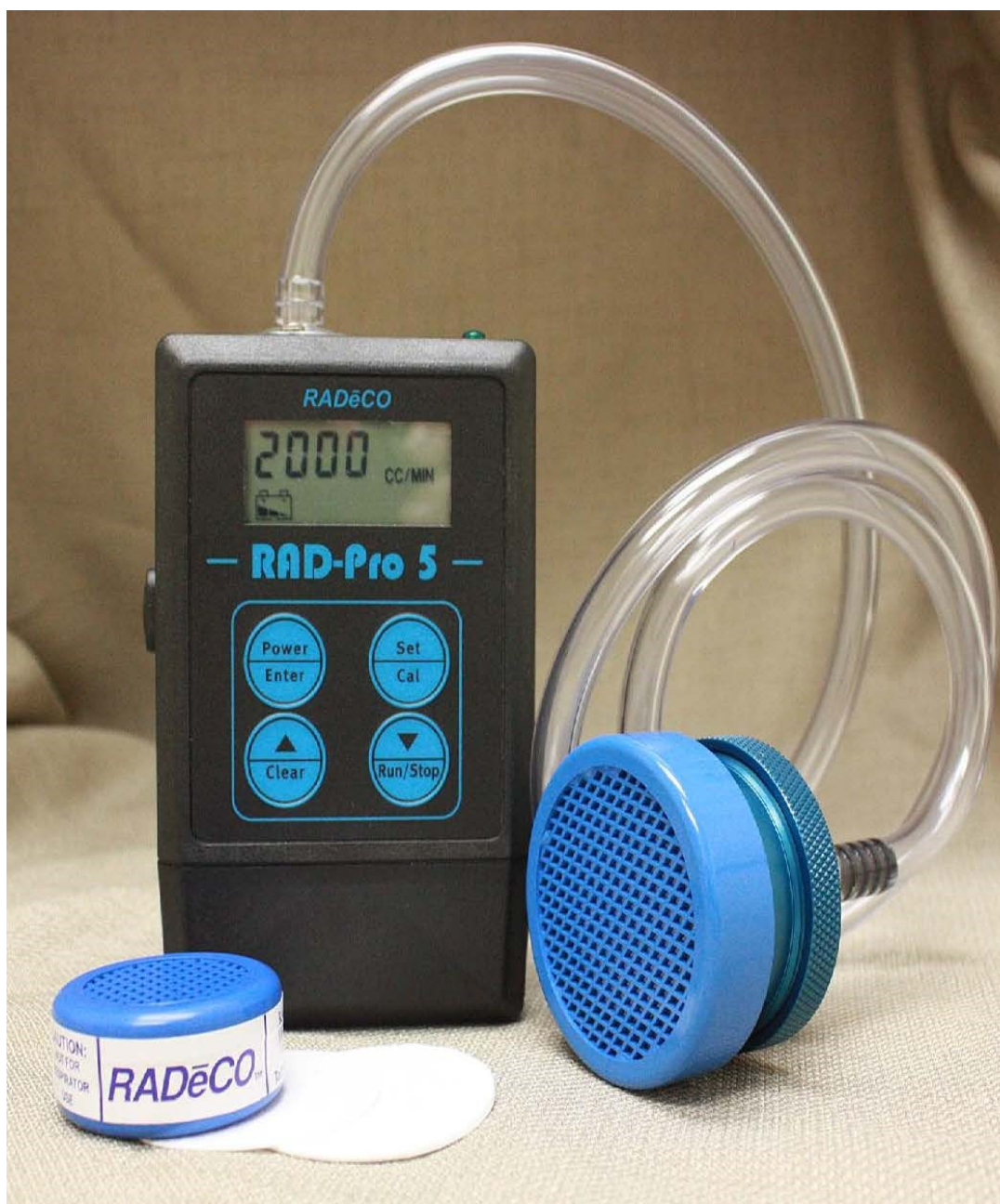
RAD-Pro 5 Kit